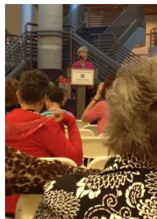
Listening to the speaker, who has never smoked, tell us about her lung cancer battle that she's winning